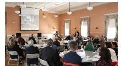
M3 Infrastructure & Transportation Meeting

Middlesex 3 works closely with regional business, municipal, state, federal, educational, real estate and community leaders. Middlesex 3 hosts a series of stakeholder meetings, which focus on the M3 target areas and priorities, including transportation, education and workforce development, healthcare, housing, permitting and infrastructure improvements, and real estate development. These are member-only meetings and provide an opportunity to discuss economic development programs and policies that impact our region's business climate. Middlesex 3 members can attend these meetings at no cost.