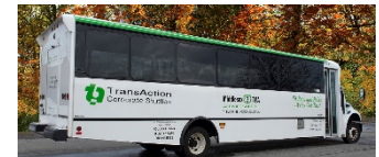
M3TMA Shuttle- Service from Alewife to M3 region.

Middlesex 3 members have access to economic development information, upcoming events and resources on the M3 member newsletters, social media promotion, & more. In addition, M3 members will have access to alternative transportation information and resources, through the Middlesex 3 Transportation Management Association (M3TMA). Middlesex 3 members receive a discounted TMA rate.