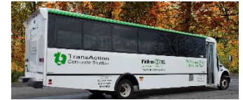
M3TMA Shuttle- Service from Alewife to M3 region.

Middlesex 3 members have access to economic development information, upcoming events and resources on the M3 member newsletters, social media promotion, & more. In addition, M3 members will have access to alternative transportation information and resources, through the Middlesex 3 Transportation Management Association (M3TMA). Middlesex 3 members receive a discounted TMA rate.